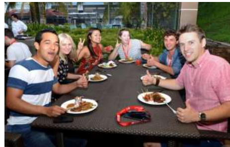
Make friends from all over the world

Ranked among the top 1% of universities worldwide, NTU places you in an academically stimulating environment that is both culturally and socially enriching. Our comprehensive and innovative approach towards education and research will help contribute to your future success and inspire you to realise your full potential as an entrepreneurial and technologically-savvy leader.