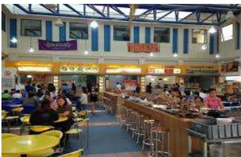
Hall of Residence Canteen