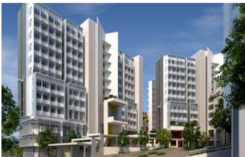
NTU Hall of Residence